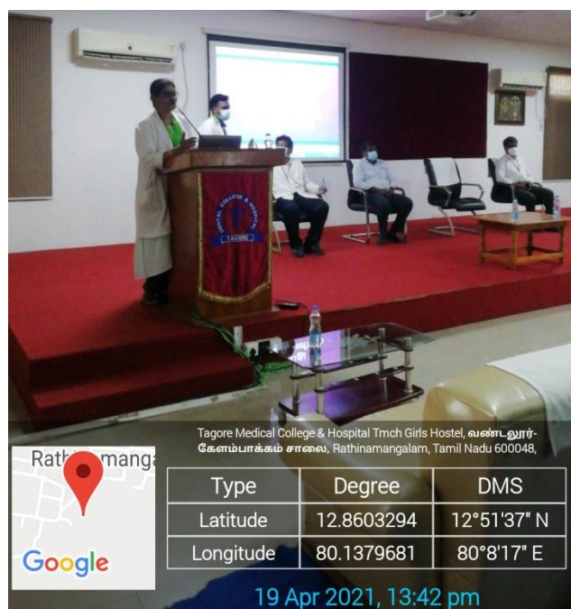
Inaugural speech by Principal