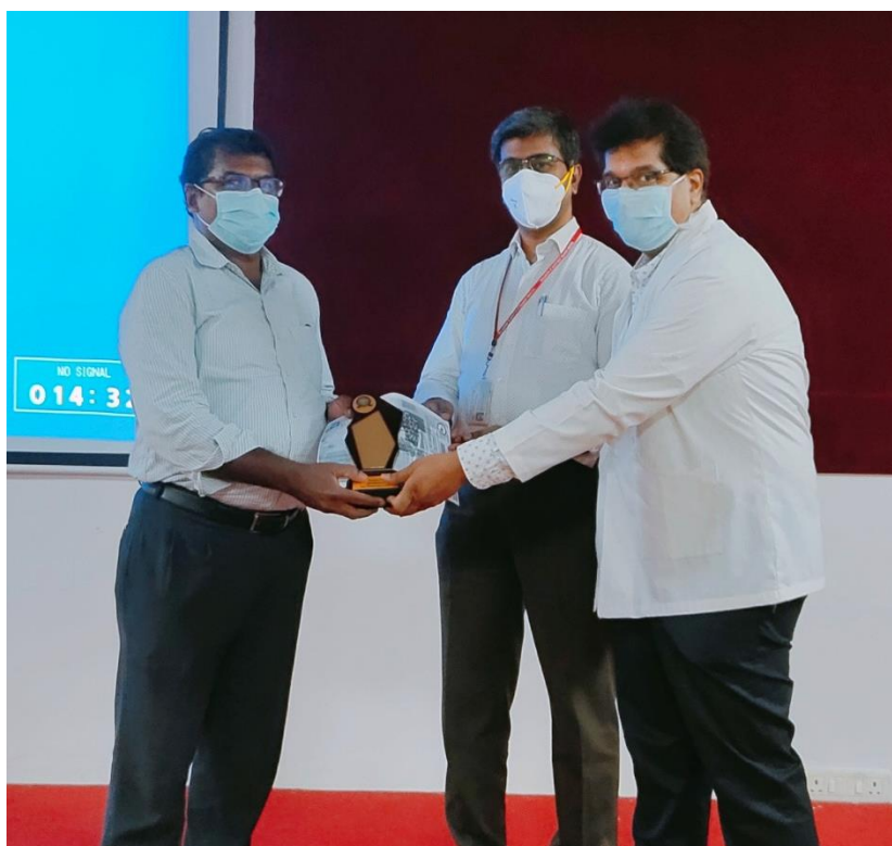
Felicitation by Vice Principal – Research & Development